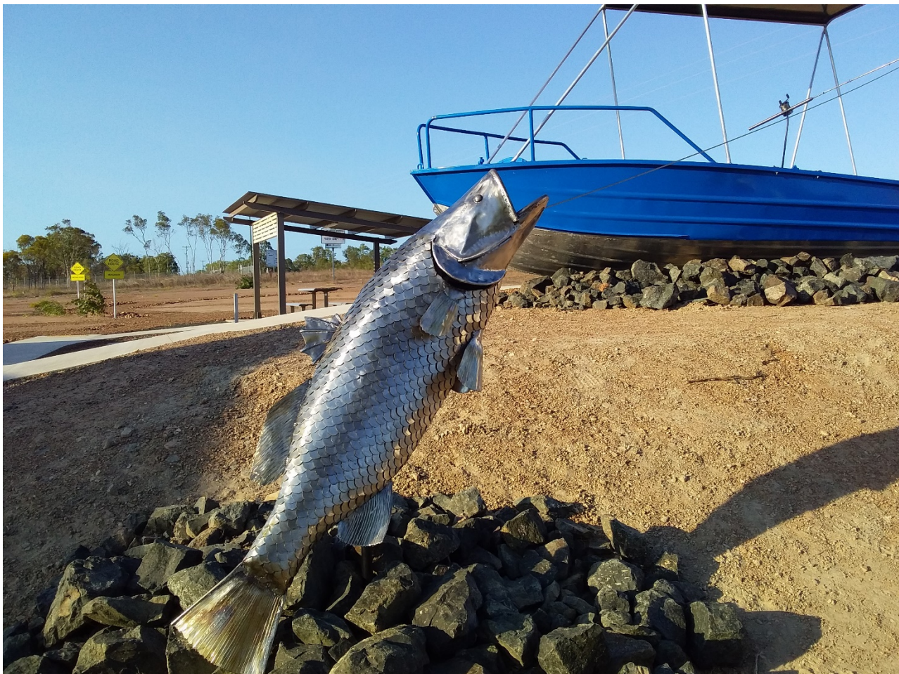
Above - The first public art installation at Lakeland

The vision is for each community to develop visually persuasive public art sculptures, potentially created from recycled materials depicting each unique community of Cape York Peninsula.